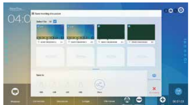
One click share by Email or USB flash.