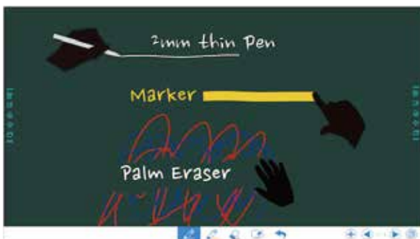
Enhance communication with discussion board/annotation.