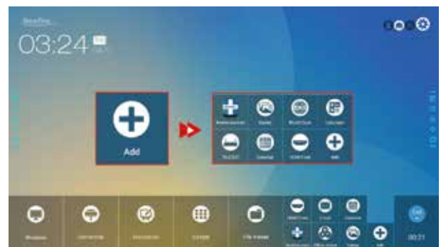
Become an expert with an intuitive interface.