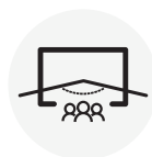
178° View Angle