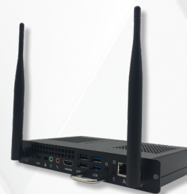
OPS On-Board Computer - UC Ready Z Pro Series Only