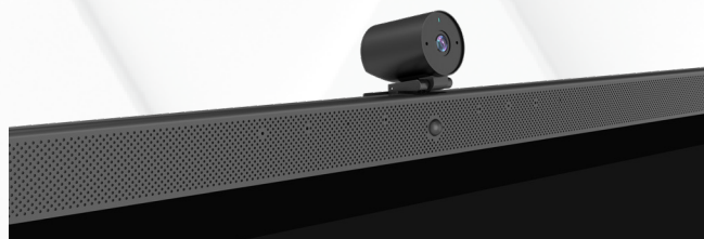
4K AI Camera - UC Ready Z Pro Series Only