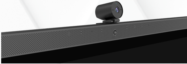
4K AI Camera - UC Ready Z Pro Series Only