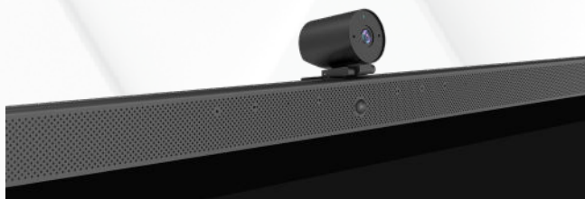
4K AI Camera - UC Ready Z Pro Series Only