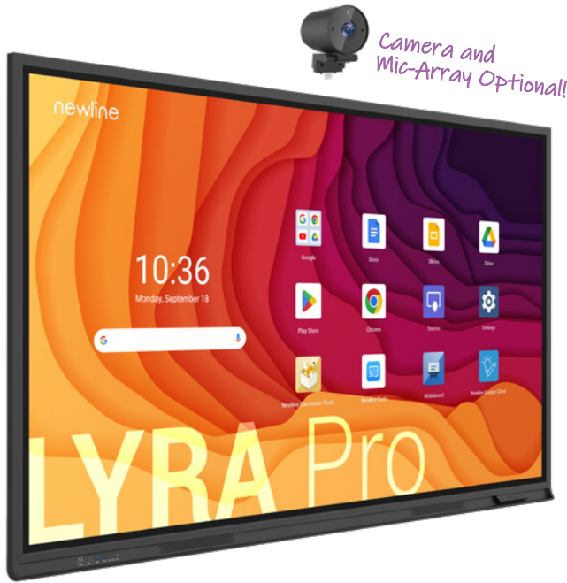
Camera and Mic-Array Optional!

Lyra is a small constellation in the northern sky hosting Vega, one of the brightest stars in the night sky, and the Ring Nebula.